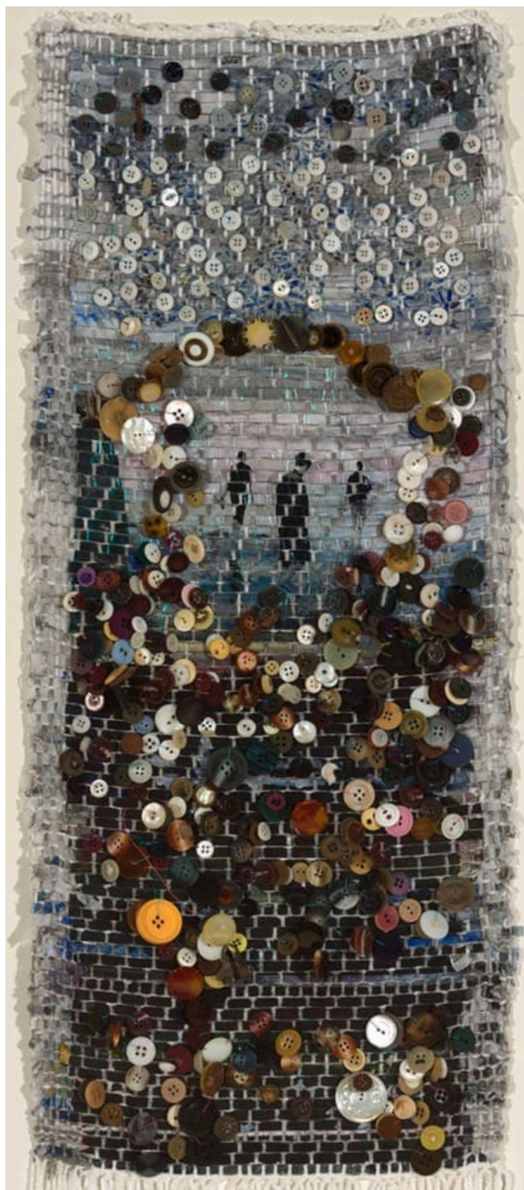
Aperture, 2014 | woven mixed media, 30 x 12 inches

We were Taken with it too – Skudera presents us with one the most inventive examples of contemporary collage. The manipulation and interpretation of photography is being stretched out of its old familiar format now that digital has become the top dog. Film and printing continue to be used, but in wilder, more abstract, innovative ways than they were initially made for. Her use of photographs as raw material for weaving a base for her work marries the equally analog world of fiber arts, culminating in objects that are as appealing texturally as visually. There is space for the work to breathe, open fretwork here and there, button reference points, you can look at the surface and then sink in deeper. There's a conceptual element as well, the artist as needleworker, darner, knitter that gives the works a homey familiarity and the color palette evokes a nebulous but nostalgic place in time.